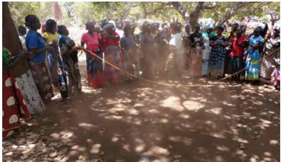
Social cohesion activities to promote peace and unity despite religious differences among IDPs in Corrane camp. Above: Women jumping rope and Below: children engaging in various recreational activities in the camp.