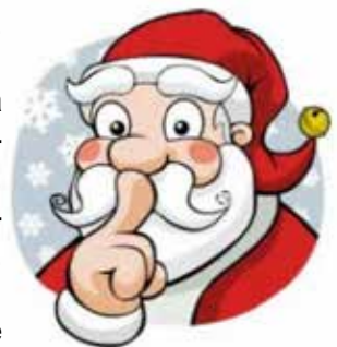
From the Boss!

Thank you all for your hard work through-out the year!