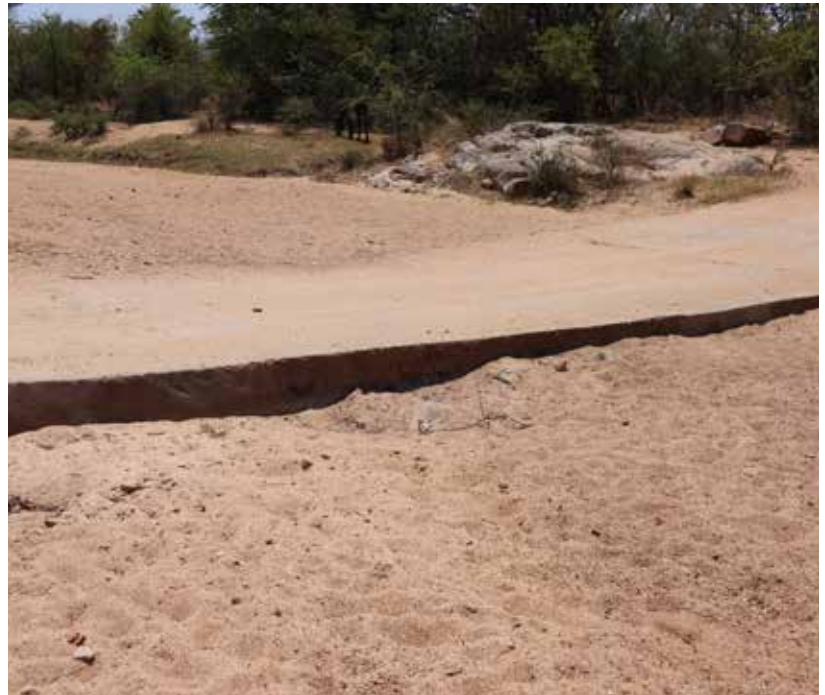
A silted river with a low lying bridge in Matobo, Matabeleland South, which once provided water for the local community and their livestock.

Clearly, the water is not enough and with climate change, rains are unpredictable. No rain means no water, no crops means no food, no fodder means more livestock deaths, which in turn means more hardships, and even