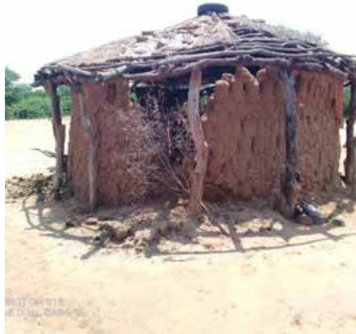
One of the pole and dagga huts swept away by flash floods in January 2021, in Matobo. ZRBF-Sizimele built 15 new homes for victims of the floods.

In remote places people continue to reside mainly in traditional pole and dagga huts, easily swept away by storms, flash floods and cyclones, as witnessed by DCA in Matobo, in January 2021.