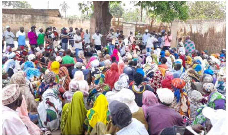
A community meeting to promote sanitation and hygiene in Corrane Refugee camp facilitated by DCA in September 2021. The bulk of the population in the camp are women in children.

The situation in Mozambique has been greatly aggravated by the Islamic insurgency. Media reports claim that they believe that Islam as practiced in Mozambique has been corrupted and no longer follows the teachings of Muhammad, despite only 18.3% of the population in Mozambique being Muslim.