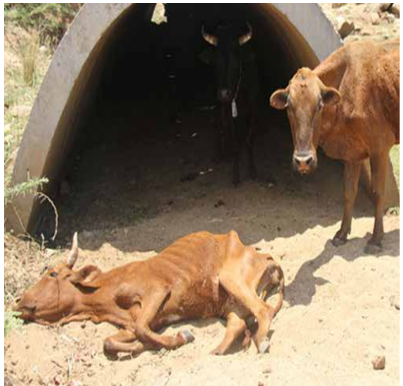
Cattle losses from a lack of grazing and water in Beitbridge province