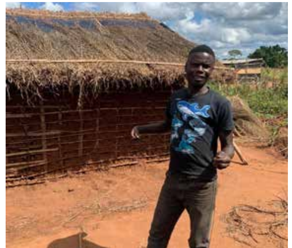
Beneficiaries from the UN World Food Programme initiative in refugee camps, eating beans and rice to supplement their diet. Below: A young woman preparing green beans for the family.

In September 2020, the UN's World Food Program warned that tens of thousands of people had been deprived of humanitarian aid in northern Mozambique as conflict intensified, leaving millions isolated and in need of critical assistance.