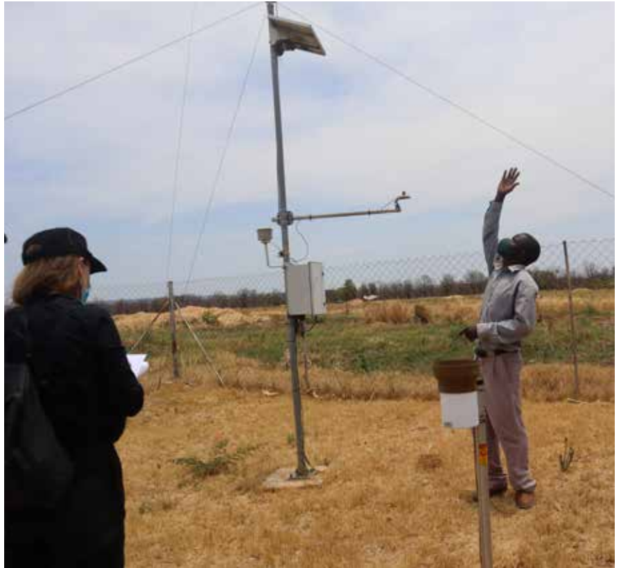
Lupane Agritex Officer demonstrating the ZRBF-Sizimele weather station and rain gauge facilities

Elsewhere, in Matobo, ZRBF-Sizimele has built the capacity of the local irrigation scheme to adopt a drip irrigation system to improve water use efficiency, where this commodity is scarce.