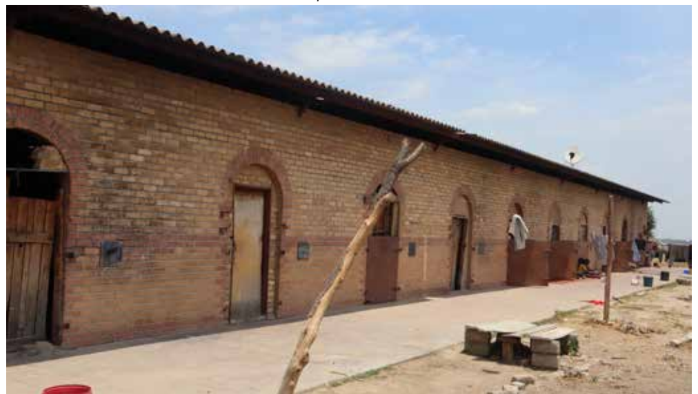
Former stable pens in Eyestone Mabhiza Compound in Harare South. The stables are now occupied by over 200 families. Grass covered pit latrines have been built as there are no sanitation facilities. The community fetches water from surrounding open shallow wells. Those who have jobs are mostly involved in sand poaching in the area.