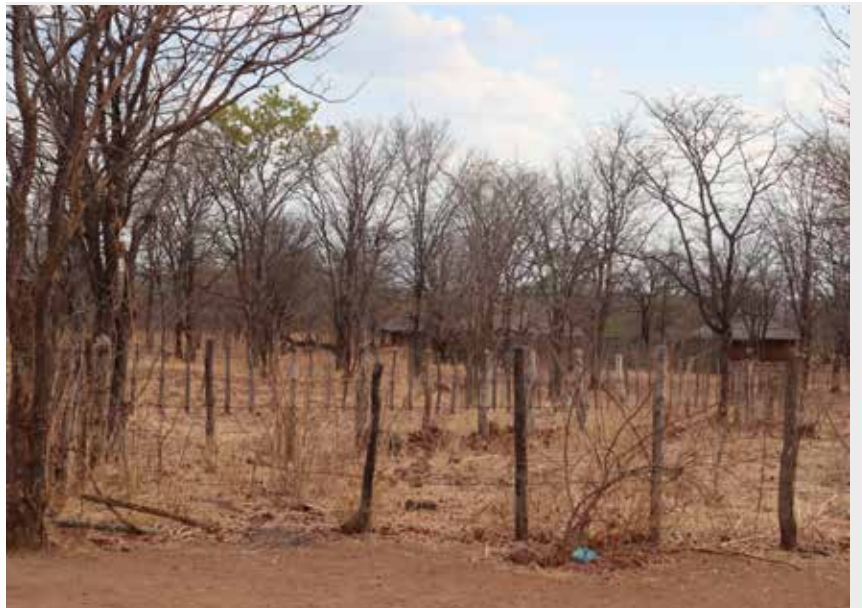
A homestead in Hwange province where there has been previous contact with elephants from the National Park. According to the Zimbabwe Parks and Wildlife Management Authority, 60 people died due to human-wildlife conflict in Matabeleland North, between January and November 2021, while 40 people were injured. In the same period, 4000 cattle were killed by lions and hyenas.

As DanChurchAid enters into its global centenary, DCA Zimbabwe will launch the next 100 years with a shift in country programme focus. The flagship project under the new biodiversity programming strategy, is called "Utariri" meaning stewardship. The Utariri Biodiversity project is targeting geographies where increased human settlement has interfered with traditional biodiversity conservancies and corridors through agrarian land use, firewood extraction, poaching and illicit wildlife trading. Shrinking biodiversity habitats amid increasingly dry conditions owing to climate change and prevailing macroeconomic challenges have exacerbated biodiversity losses. Once internationally recognized for its conservation of threatened biodiversity, Zimbabwe is suffering from accelerated biodiversity losses accompanied by an underperforming economy and compromised livelihoods. The cumulative effect of political, development and colonial binaries greatly accounts for the state of biodiversity in Zimbabwe today. Given the conflict between the conservation and development agenda, DCA will continue to build on the century-long lessons to eradicate chronic vulnerability in communities living in the Zambezi valley basin. Climate change has severely increased water stress and habitat depreciation exacerbating human-biodiversity conflict. Notwithstanding these constraints, Zimbabwe's ecological regions still provide habitats for an abundant and diverse flora and fauna.