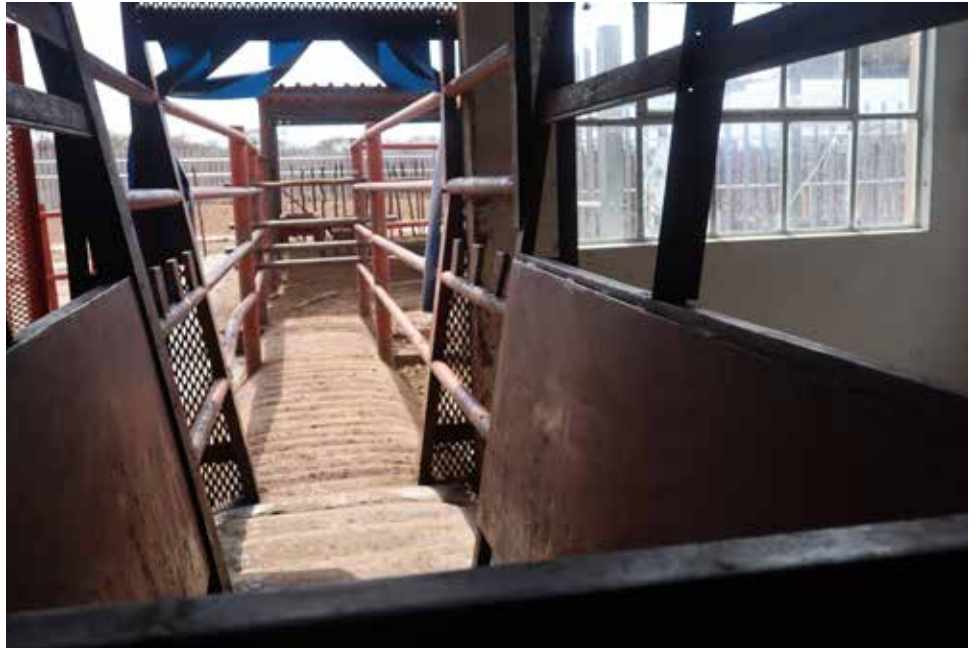
The Grade B, Jotsholo Abattoir in Lupane is currently operating at 30% capacity slaughtering approximately 136 cattle per month, it has the capacity to process 100 cattle per day. The vision is for it to become the biggest abattoir in the province. The result of a Public Private Partnership, the abattoir is in line with the National Development Strategy and Vision 2030.

By working with the church fraternity and residence associations DCA is promoting social cohesion through peace building initiatives at local level. While the disaster