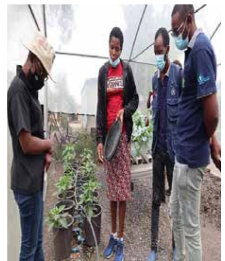
DCA Urban Resilience team observing water efficient hydroponic systems in Gweru. Temperatures in Zimbabwe have increased by two degrees making it more difficult for urban farmers to grown vegetables for household consumption using traditional methods.