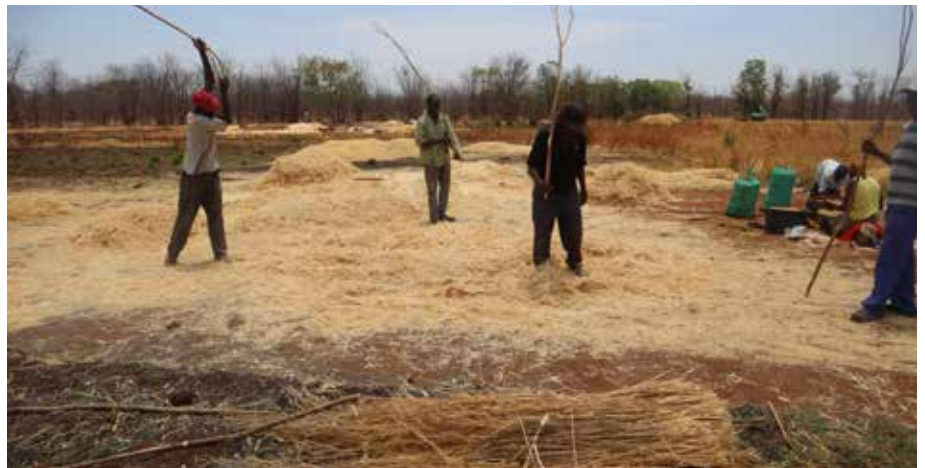
Farmers manually threshing their crops at the ZRBF-Sizimele, Tshongonkwe Irrigation Scheme in Lupane