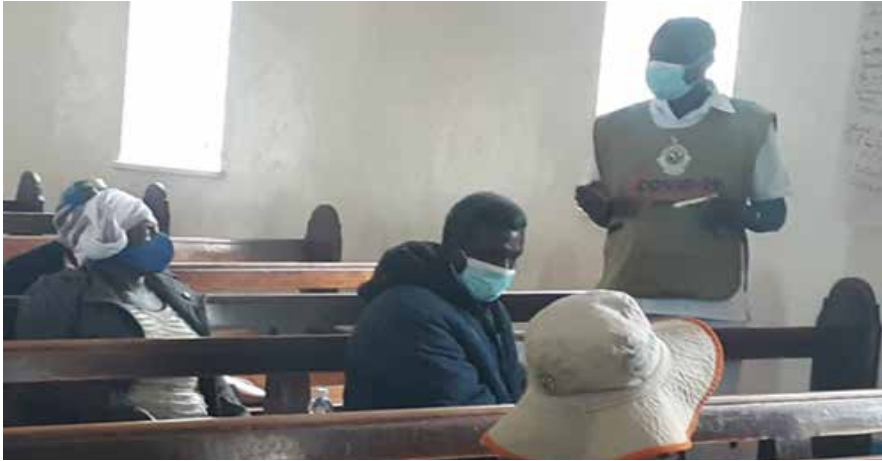
Training of traditional and religious leaders in Manama, Gwanda, Matabeleland South, by MoHCC staff

Like the grim-reaper claiming lives of the rich and poor alike, the COVID-19 pandemic swept through communities and brought the world to a global stand-still.