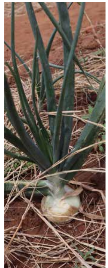
Tjehondo community garden member, 'Gogo' Lita Sibanda giving a tour of the cleared garden where they plan to grow onions and other vegetables for household consumption using water from the solarised borehole made possible by contributions from Danish corporates through the Villages Project.