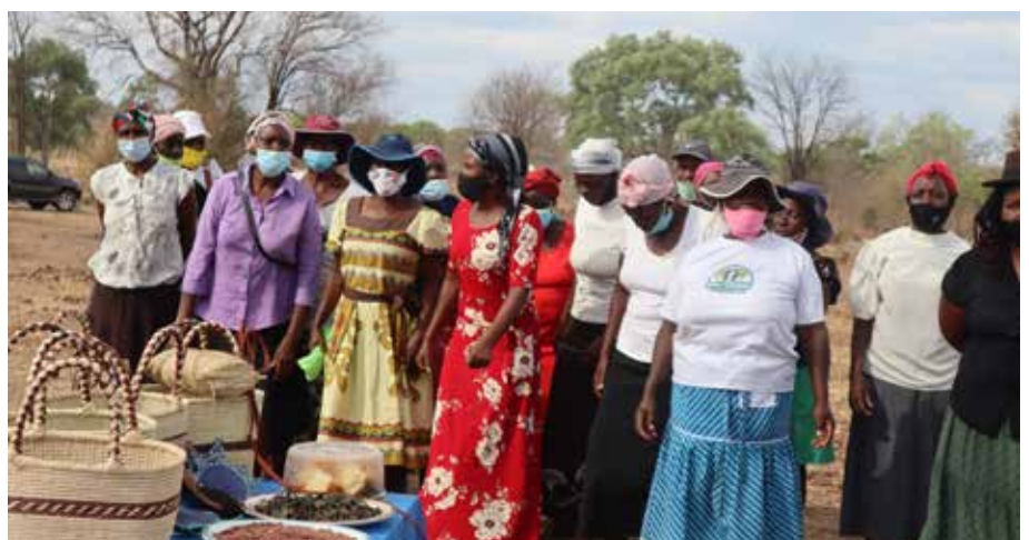
Women from the Menyezwa:Simunye group in Lupane, showing off their wares, including woven baskets, ground nuts, maize, beans, dried vegetables and more. A solarized borehole has been drilled for them with support from Danish corporates through the villages project.