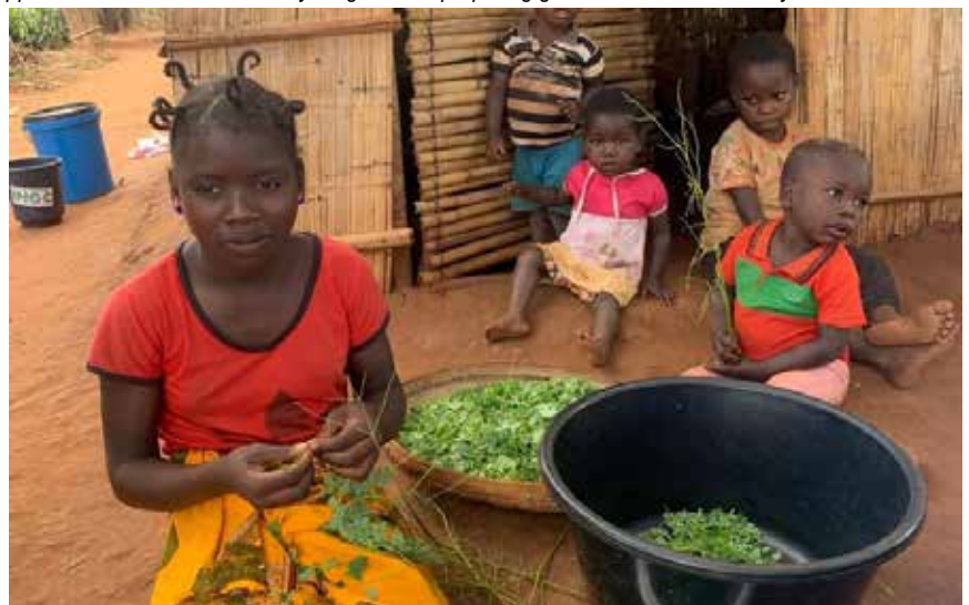
Most IDPs in the refugee camps in Mozambique are women and children.

Seeing the need, DanChurchAid, on the eve of its' 100-year anniversary of supporting the world's poorest people, stepped up to the plate to respond to the humanitarian crisis.