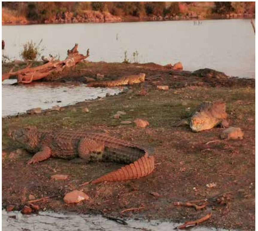
Six crocodiles enjoying the sunset on a crocodile island on the Mutshlichokwe dam, in Beitbridge. The high population of crocodiles has increased the threat of attacks on humans. Zim-Parks says the two main animals to attack humans are elephants and crocodiles, followed by buffalo and lions.