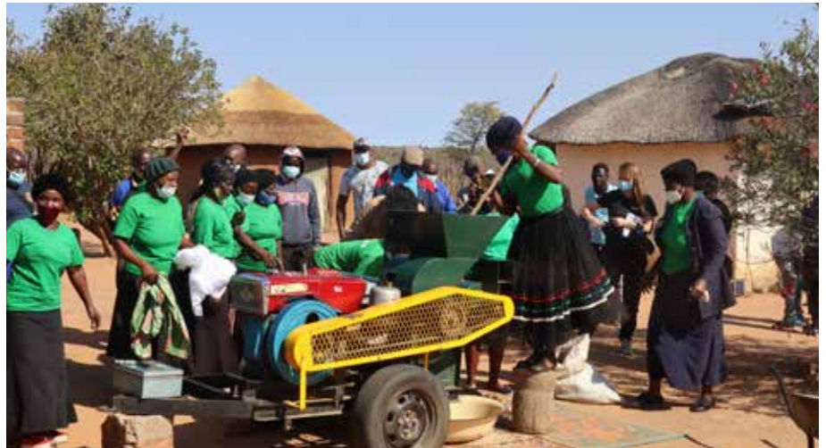
The Matobo TsetseMbuya womens group showing off their diesel powered thresher purchased by ZRBF- Sizimele with support from Danish Corporates through the Villages Project.

More than R10,000.00 (USD714) has been raised by participating farmers who have since invested the money into the purchase of goats, and are planning to secure another thresher in the near future.