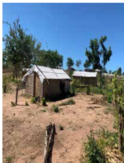
Basic accommodation for IDPs in refugee camps.